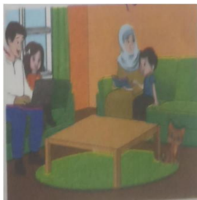
Figure 9 Home Culture and Intellectual Activities